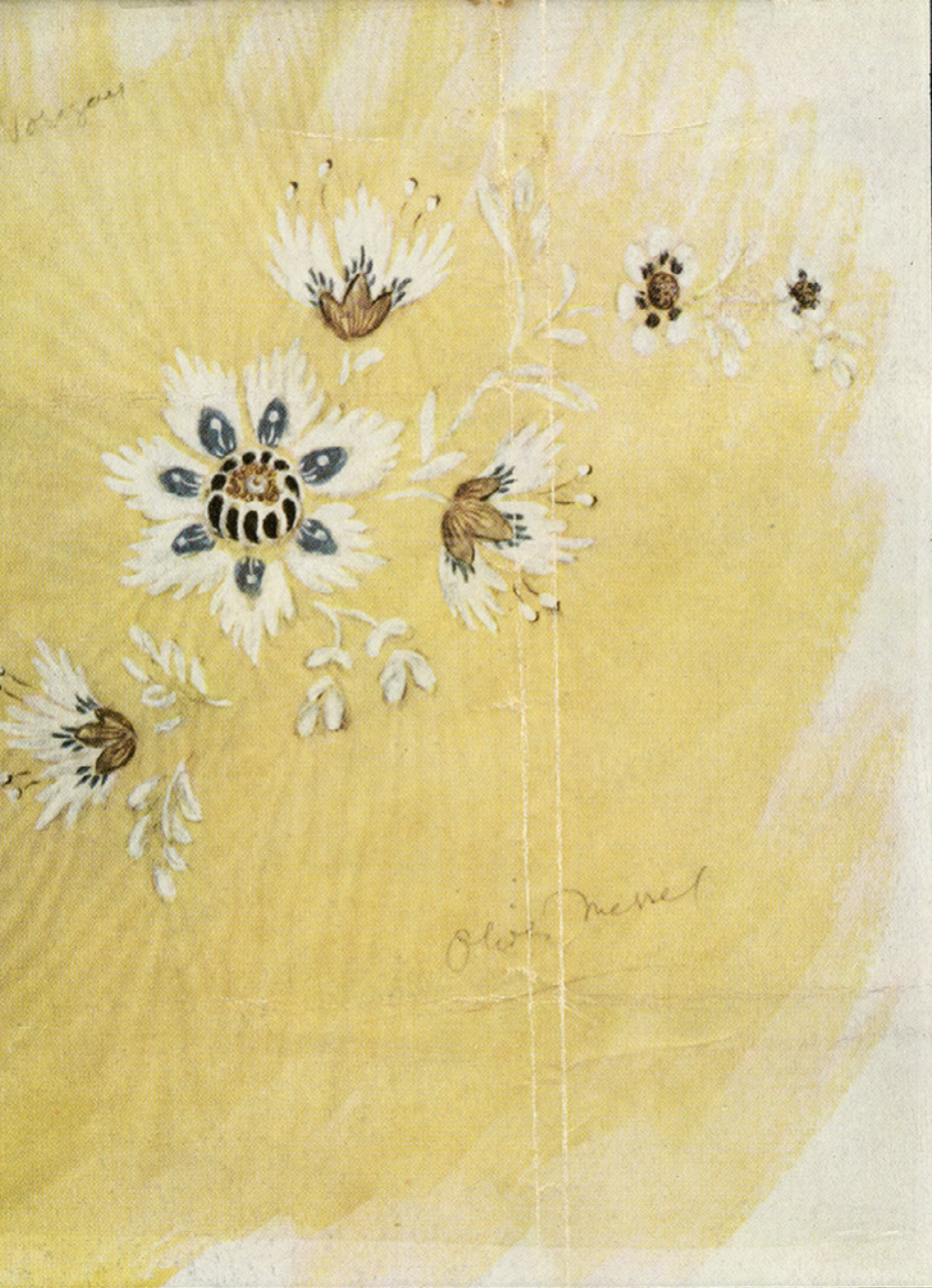
Left: Press cutting from Vogue featuring Sekers fabric designs by Graham Sutherland, Cecil Beaton and Oliver Messel, July 1959, OHM/1/8/2/6

The accompanying Designing Textiles image pack contains a number of images related to Oliver Messel's textile designs along with a list of useful links to complementary material in the V&A's online catalogue.