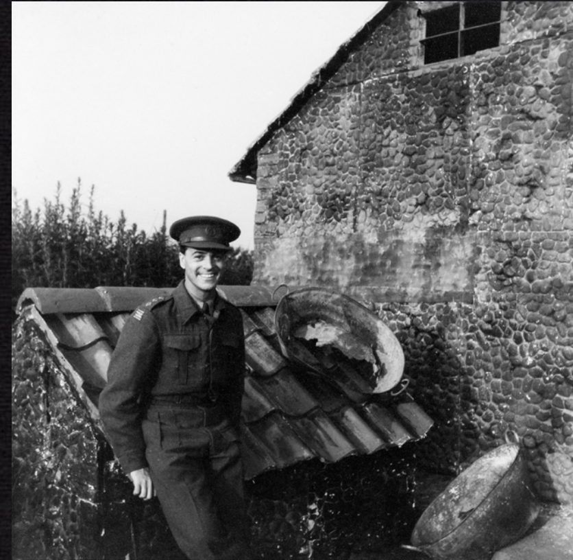
Left: Black and white photograph of Oliver Messel leaning against a small outhouse beside a larger building which is actually camouflaged canvas flats, c.1940-44, OHM/1/15/13

The accompanying Artists and World War Two image pack contains a number of images relevant to Oliver Messel's time in the Royal Engineers during World War Two.